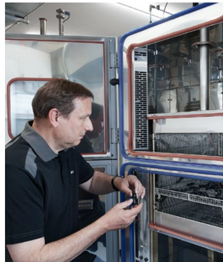
Climate test and temperature shock