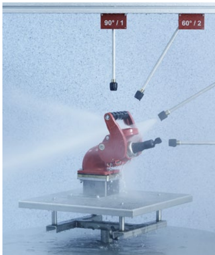
IP test system for water jet protection