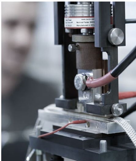
Material testing of MULTILAM: pressure resistance